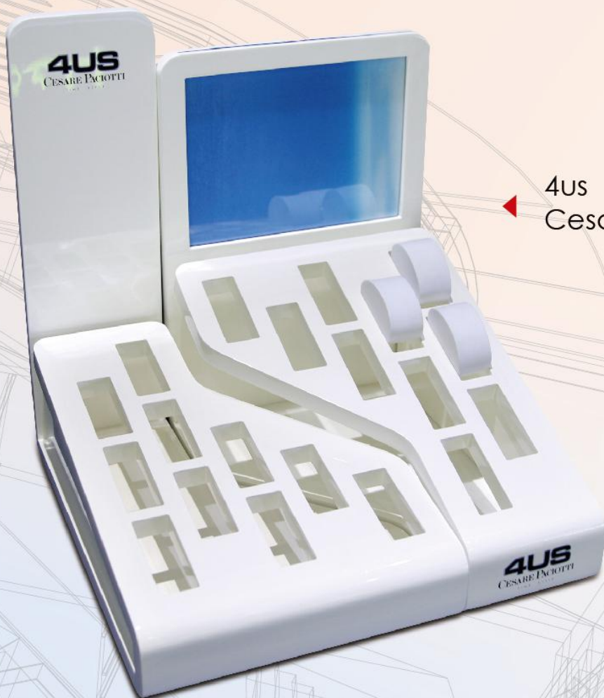
4us Cesare Paciotti